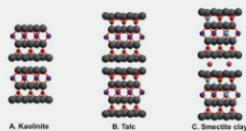
FIGURE 2: Clay minerals family